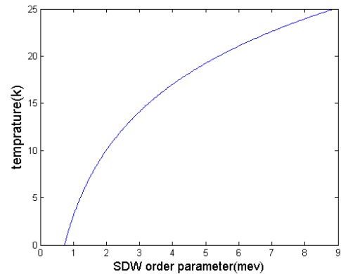
FIGURE 2. Spin density wave transition temperature ( T_{sdw} ) versus spin density wave order parameter ( \Delta_{sdw} ).

Furthermore, the spin density wave transition temperature ( T_{sdw} ) versus spin density wave order parameter ( \Delta_{sdw} ) of BaFe_{2-x}Co_xAs_2 is plotted as shown in Figure 2.